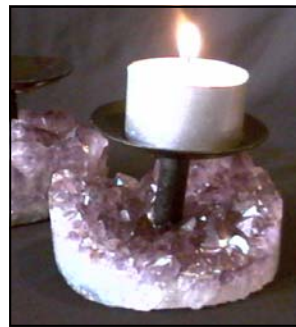
Amethyst Candle Holder Newsletter Special $24.

place under your pillow. This is a great one for the kids too. Get them involved in helping themselves get to sleep with their own special crystal.